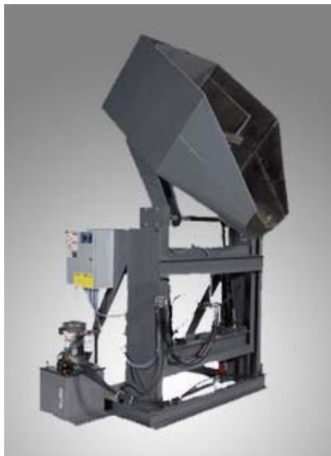
4000# CAPACITY FOR SMALL BRASS PARTS