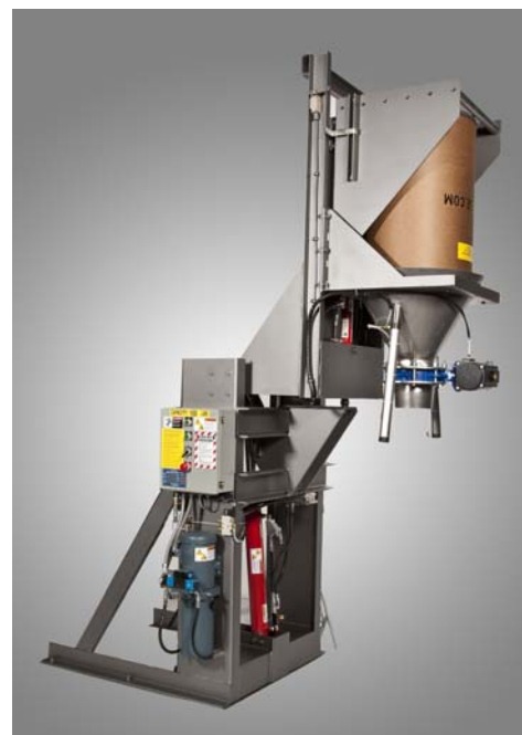
100# CAPACITY, LIFT & SEAL FOR A HYDROSCOPIC POWDER